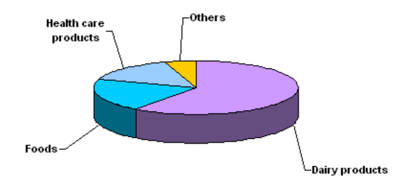
Figure III-2.5.1 Consumption proportion of IMO in major end use applications in China, 2010